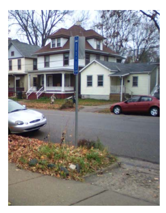
Example of "Board Bus at Corner" sign

Metro Transit currently serves just over 2,000 unique bus stop locations. About 1,000 of these signs are expected to lack any information on the rear side of the signage at present. The Committee proposes a pilot project to mark both sides of bus stop signs. The pilot project would consist of applying an adhesive sticker, produced by the City of Madison sign shop, to the rear sides of bus stop signs. Metro should pick a trial route to test, install these stickers and collect passenger feedback. If the presence of stickers makes it easier to identify stops and thus to ride the bus, they should be placed on all remaining signs.