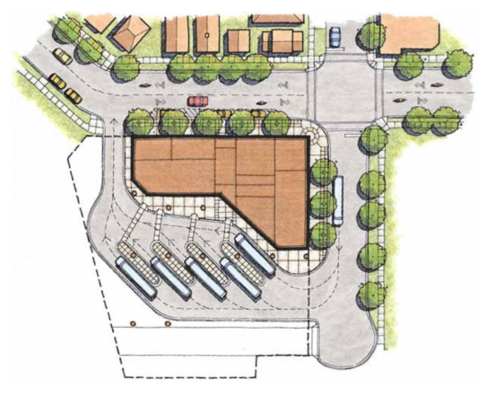
Figure 7 The design of the 2014 ITC

Susan provided input as herself, but as the president of the MABA, she has more insights for the topic than the general public. She thought the current intercity bus service is not ideal because of the poor service and the traffic safety concern. The future IBT should be designed to have at least the inclusion of the basic function which includes heating, comfortable seating area, restrooms, and vending machines. The location of the IBT should be connective with other modes of transportation. A second terminal outside of the downtown should also be considered to satisfy more people's need.