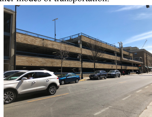
Figure 6 State Street Campus Garage

The city has more power to decide the direction of the IBT project, but since it is still 4 to 5 years away, the reply from David wasn't very detailed. David gave some input about the current situation, the future site selection, and the future design of the IBT. The location the city will possibly develop the IBT is the current State Street Campus Garage (Figure 6). The site is bigger than the 2014 ITC site (Figure 7) which would provide enough space for the development. The advantage of close to the campus and downtown attractions is to have higher possibly attracting more users and has more potential to develop other uses.