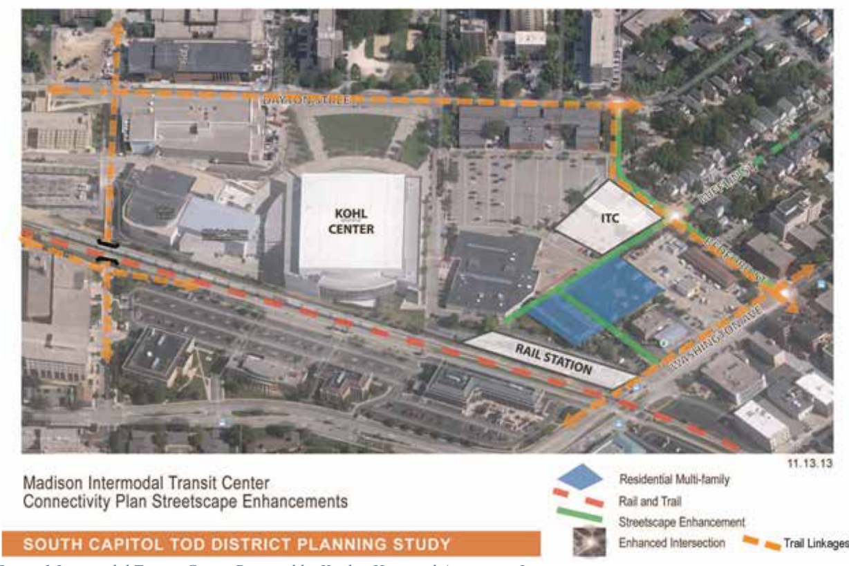
Figure 1 Intermodal Transit Center Proposal by Kimley-Horn and Associates, Inc.

with the bus route 80 (University of Wisconsin - Madison 2015). In the City of Madison's Downtown Plan of 2012, though not explicitly states the need for the IBT, a recommendation for the intercity bus service is to integrate it with other modes of transportation options (Department of Planning and Community and Economic Development 2012). Madison in Motion: Transportation Plan Background Document of 2017 states that Madison is an important hub for intercity bus services in Upper Midwest and should keep pushing and improving the development and growth which include the intercity bus terminal. About 25 articles on the Madison Area Bus Advocates' (MABA) website started before the shutdown of the Badger Coach Bus Depot in 2009 studied and advocated for the IBT in Madison. These indicate the importance of the intercity bus service in Madison and the public's value on establishing the IBT; the future plan should focus on improving and expanding the intercity bus service.