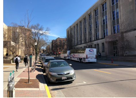
Figure 4 University Avenue Figure 5 Additional Space on Langdon Street

Through three observations, safety and congestion issues have emerged. The intercity bus run through four pedestrian crossings, which all have high volume during school hours and only the one on University Avenue is signalized. Intercity buses are normally heavier than local buses which means they take more time to start and stop. This is not only creating a dangerous