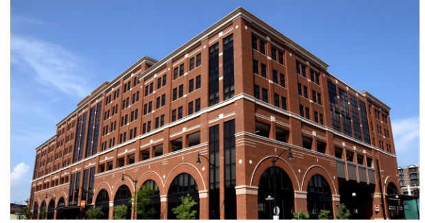
Figure 2 Grand River Station.

project. It is also being mentioned by the city planner through the interview of the project. The terminal opened in August 2010 after two years of construction. It is a six-story IBT with 8 bus transfer station, 13,000 square feet of commercial space, and 92 apartments which costed about $30 million to build (Marcus 2010). Aside from the capital cost, the maintenance fee of the terminal is huge to make the facility safe and comfortable through years,