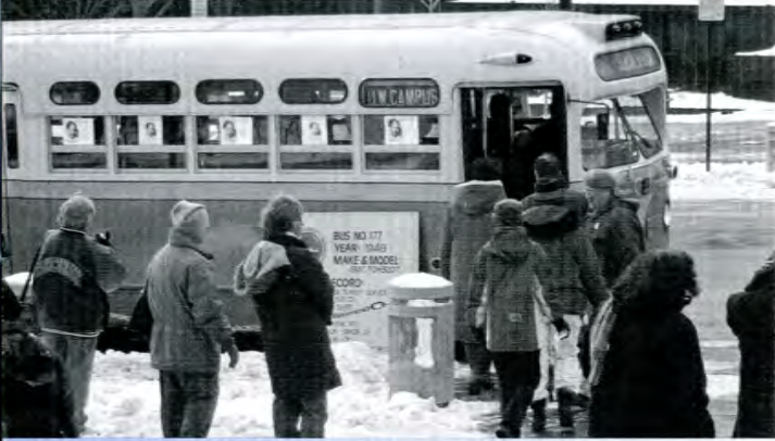
I really liked your Rosa Parks poster on the buses. It was a very appropriate way to honor Ms. Parks.