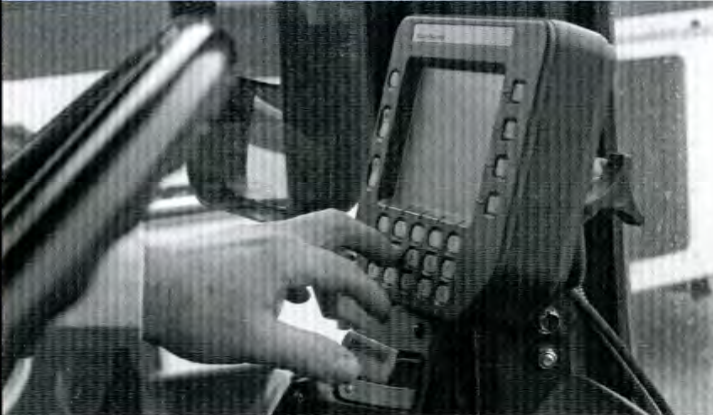
Driver mobile data terminals improve communication with Dispatch.