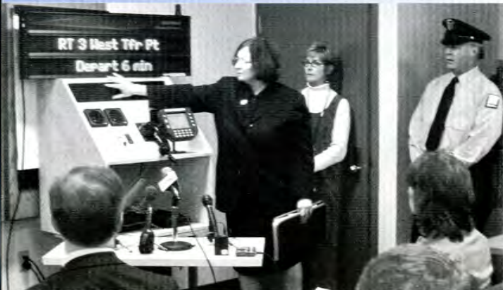
News conference demonstration of new ITS equipment.